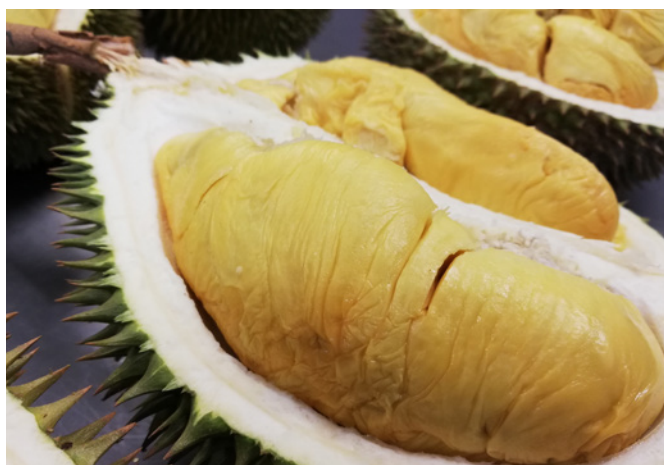
Photo 4. Durian aril color was recorded.