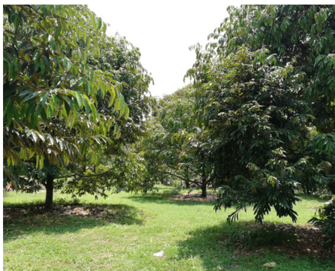
Photo 2. Six durian trees of the D101 cultivar were selected for the study on a durian farm in Tapah, Perak, Malaysia.

pH was determined using a pH meter (FP20, Mettler Toledo, USA). Calibration was conducted using buffer solutions of pH 4.0, 7.0, and 10.0. Next, the electrode of the pH meter was dipped into the sample to obtain the pH reading. When the pH meter beeped, the finalized pH of the sample was shown on the digital screen. All samples in both treatments were run in triplicate and the results were presented as mean ± standard deviation.