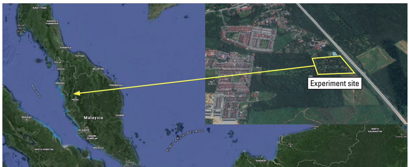
Map 1. Location of the trial carried out at a durian farm in Tapah, Perak, Malaysia.

The study was conducted from January 2020 to January 2021 at a durian farm in Tapah, Perak. Six durian trees of the D101 cultivar were selected for the study. The trees were planted in 2012-2013 on