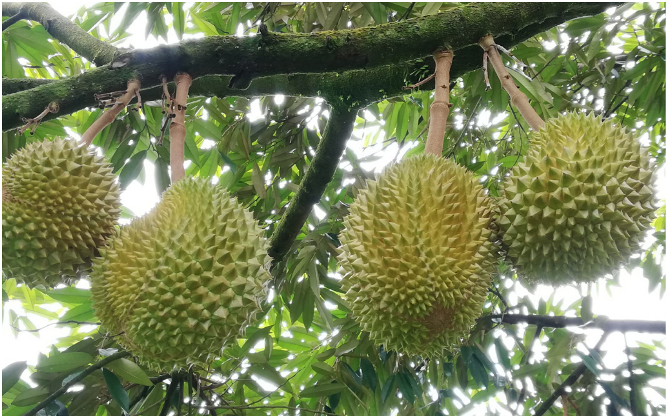
Photo 1. Durian fruit.