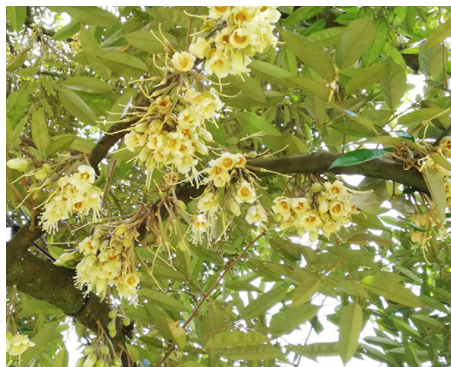
Photo 3. Flowering durian tree.