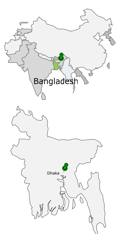
Maps of SE Asia and Bangladesh.

Dr. R.K. Tewatia (FAI) in his paper on "Emerging aspects of balanced fertilizer use in India" pointed to a remarkable growth in fertilizer application in India to about 114 kg/ha in 2006-07. The Government and industry make concerted efforts to encourage balanced use of fertilizers with a target to achieve the NPK ratio of 4:2:1 at national level. However, the country is now facing various problems including inadequate and imbalanced