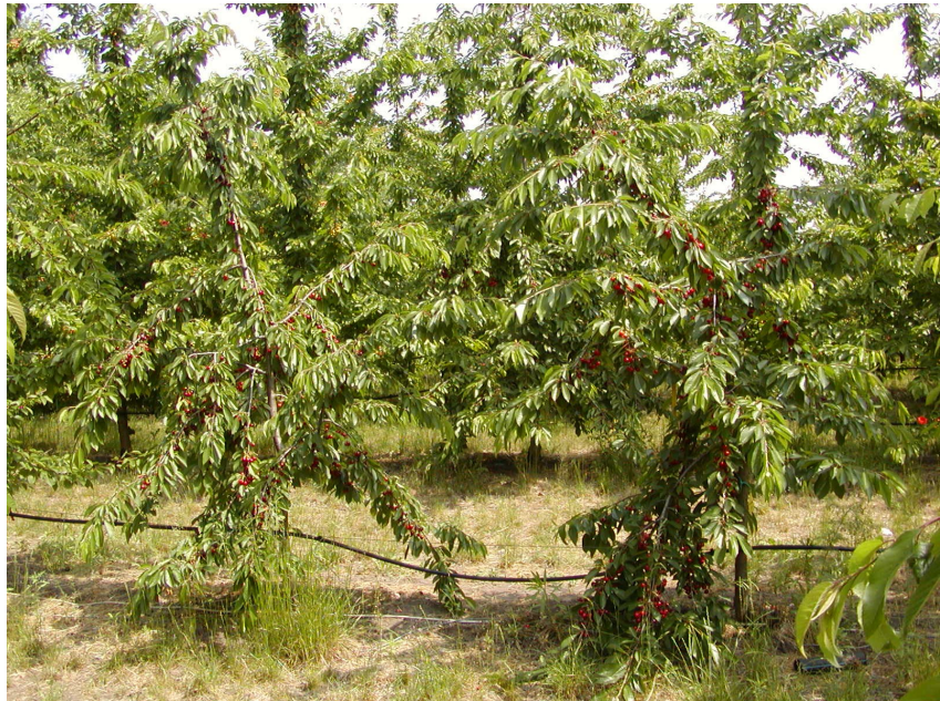
'Rita' trees on Gisela 6 rootstock. In background 'Petrus' on vigorous P. mahaleb . Hungary.

In high density orchards the young trees planted are heterografts. These are composite trees which consist of two different parts, in which the scion of one cultivar is grafted to the rootstock of another. The rootstock, which forms the root system of the tree, is responsible for the uptake of mineral nutrients from the soil. From the literature, rootstocks may be selective in nutrient uptake and transport, whereas the scion may