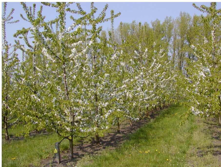
Photo 1. View of the sweet cherry orchard trained to Hungarian Cherry Spindle. 2008.

In autumn 2007 (September) soil samples at nine points within the orchard were taken and measurements