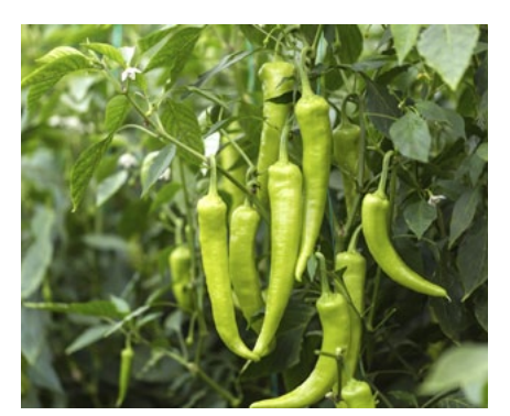
Chili pepper (Capsicum annuum L.).

The idea of splitting the K dosage into several applications arises from two basic reasons: 1) the relatively high K mobility, particularly in the sandyloam soils typical to the region of the experiment in Jharkhand; and, 2) the considerably dynamic changes in the requirements for K during plant life cycle. Successive applications of K along the growing season are assumed to ensure its availability to the plant whenever required. The results of the present study show that this assumption is generally valid. Consequently, the net return to the farmer increased in most cases (Table 3). However, K application should be adapted to an individual vegetable crop according to the altering demands through its