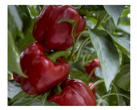
Sweet pepper (Capsicun annuum var. glossum).

Potato, the most responsive crop in this experiment, appears to have a great