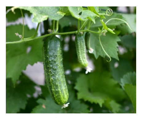
Cucumber (Cucumis sativus).