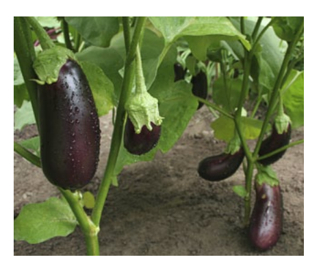
Brinjal ( Solanum melongena L.).