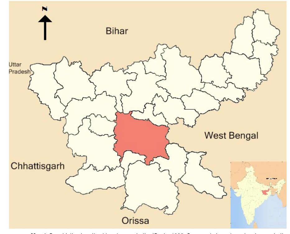
Map 1. Ranchi district, Jharkhand state, India. (By Joy1963. Own work, inset based on image: India Jharkhand locator map.svg. Licensed under CC BY-SA 3.0 via Wikimedia Commons. <u>http://commons.</u> wikimedia.org/wiki/File:JharkhandRanchi.png#/media/File:JharkhandRanchi.png).

Soils are usually incapable of replenishing the loss of nutrients demanded by crops year after year (Mengel and Kirkby, 1987). Therefore, fertilization is essential to maintain soil productivity and fertility. Successive harvests remove large quantities of nutrients from soils; if their nutritional status is not tested regularly and sufficiently restored by balanced fertilization when found to be inadequate, soils become poor. Among the major plant