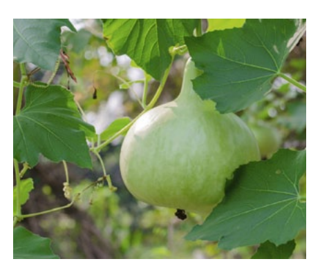
Bottle gourd (Lagenaria siceraria).