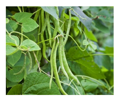
French bean (Phaseolus vulgaris).

synthesis, nitrate reduction and carbohydrate source-sink relationships and allocation. It is extremely mobile in the plant and is involved in plant water status, regulating stomatal conductance in the leaves, as well as water uptake in the roots. Potassium enhances the formation and development of fruit and tubers, and supports crop resistance against certain fungal and bacterial diseases. Soils with poor available K content usually fail to