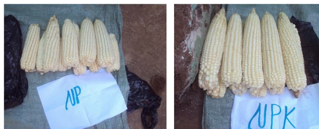
Plate 1: NP treated ears