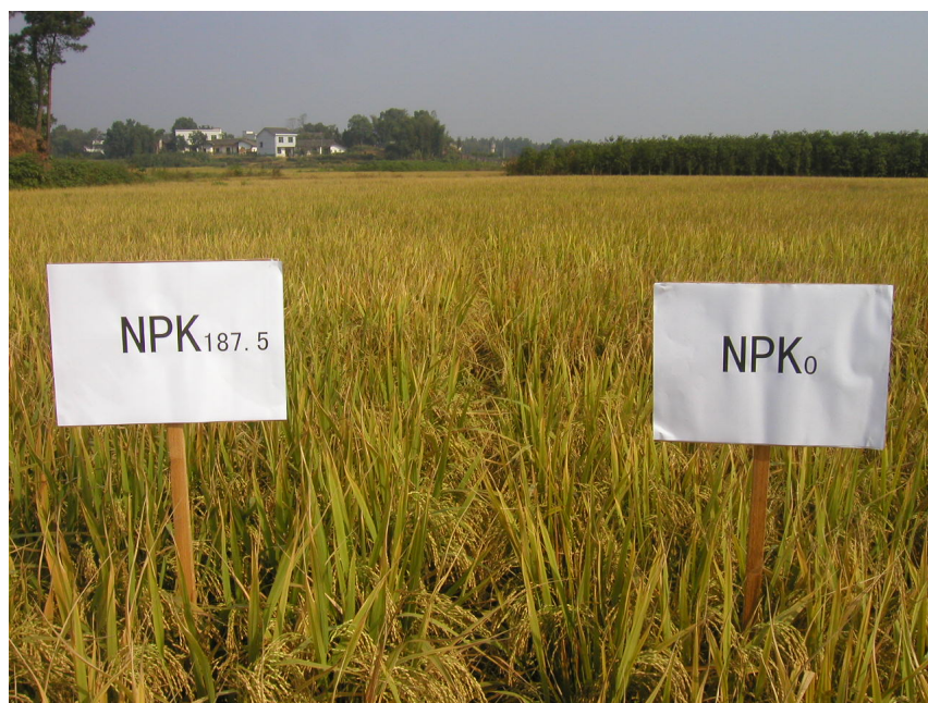
One of the experimental plots.

The paper considers the effect of potassium (K) together with nitrogen (N) and phosphorus (P) fertilizer supply on grain yield, and K use efficiency and K balance of the rice-rice cropping system in a hilly agro-ecosystem region and lake agro-ecosystem region in south China. Comparing various levels of K supply, highest grain yields were obtained at 150 kg K 2 O ha -1 , for both early and late rice in the reddish-yellow clayey soil of the hilly agro-ecosystem. For the Dongting lake agro-ecosystem, the purple calcareous clayey soil was much less responsive; K fertilizer efficiency being lower because of the higher soil available K and slowly available K contents. Grain yield increase resulting from N fertilizer was much greater than that from K fertilizer in both agro-ecosystems. The recovery by rice crop of fertilizer K was determined by measuring total of straw and grain K contents compared to the total K applied to the soil. For all three treatments of applied K, recovery rates were higher in the reddish-yellow paddy soil than in the purple calcareous clayey soil. The average value of K recovery efficiency for the three K fertilizer