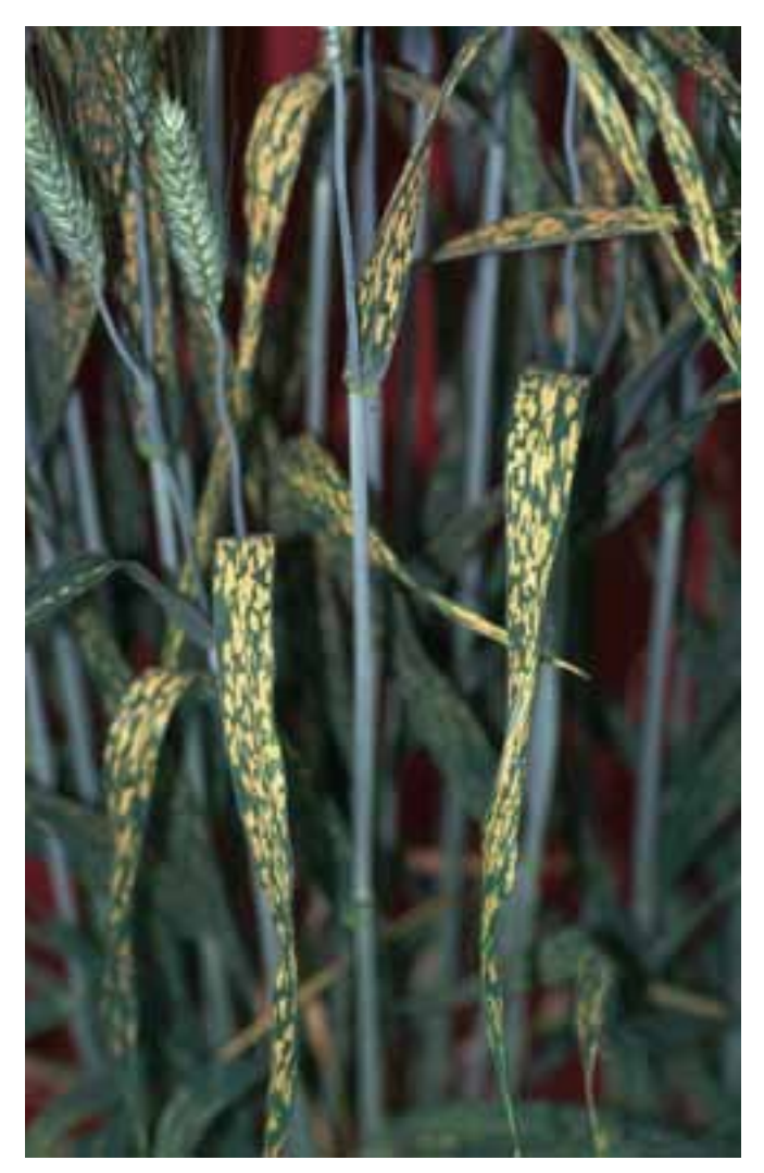
Photo 1. Chloride deficiency in WB881 durum wheat plants grown in hydroponics in a controlled growth room. The plants were grown in the absence of chloride.

also occur in crops with high Cl requirements such as kiwi fruit and palm trees (see Marschner, 2012).