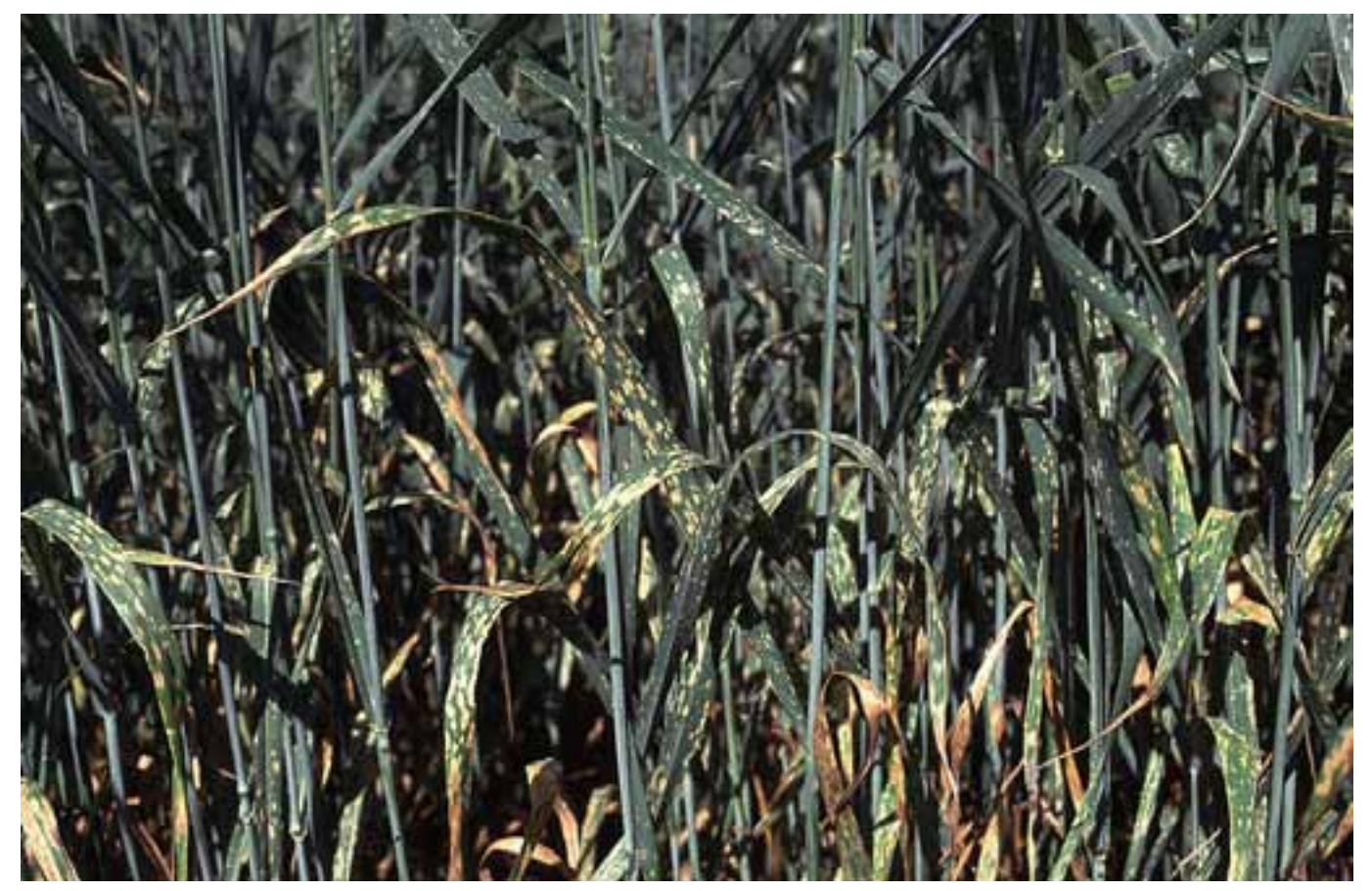
Redwin winter wheat; photos taken after flowering at a field site near Fort Smith Montana. The entire field was seeded to this cultivar and leaf spot symptoms were apparent across the entire field. The soil test very low in Cl.