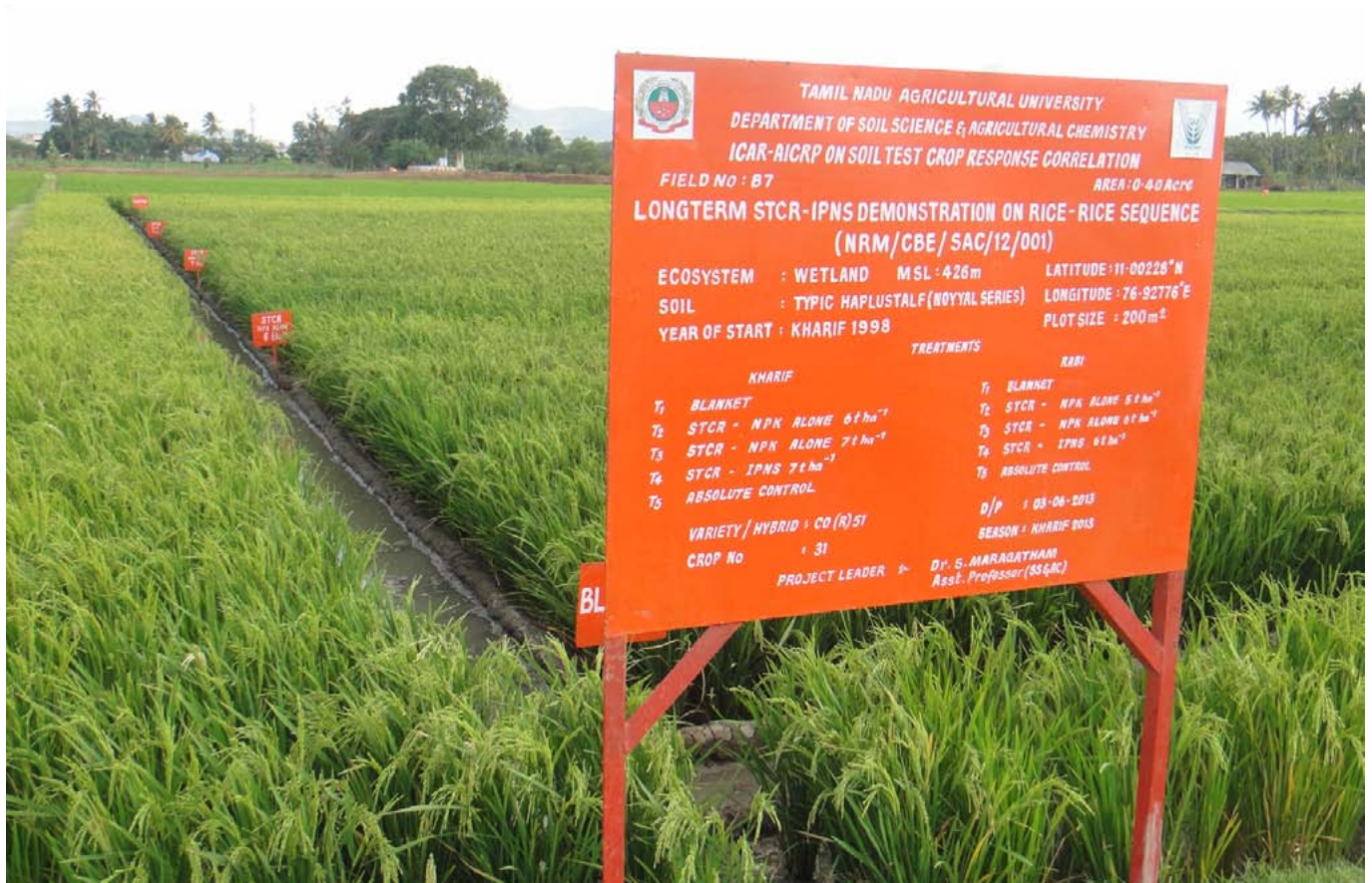
Long-term Rice-Rice field demonstration of target-yield approach. Photo by R. Santhi.