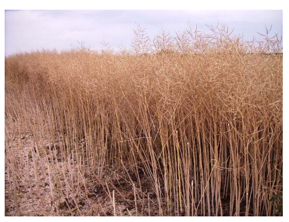
Rapeseed crop before harvest.

Despite the fact that K and K+Mg did not increase the oil content of the seeds compared to the untreated control, the oil yield data show positive effects of