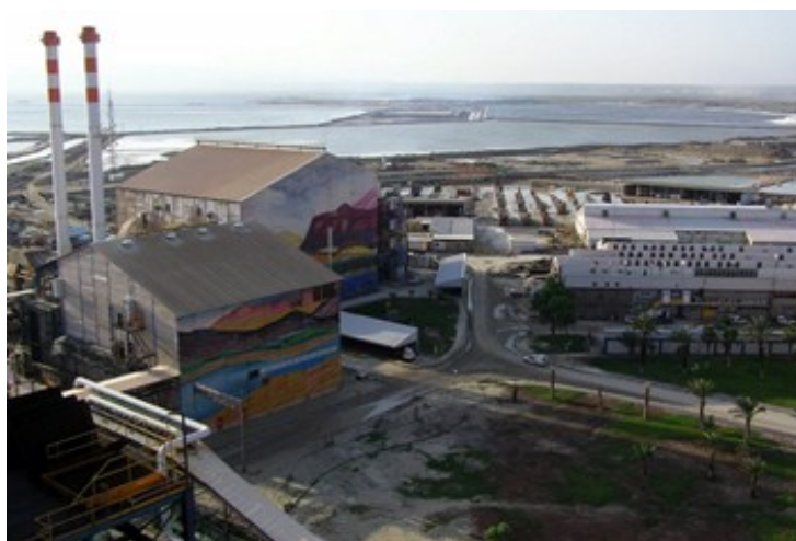
Overview of the DSW potash plant in Sdom.

(2) SKM Enviro (UK) has supported ICL through this process, and potash was among a group of products that have undergone a certification process by the Carbon Trust.