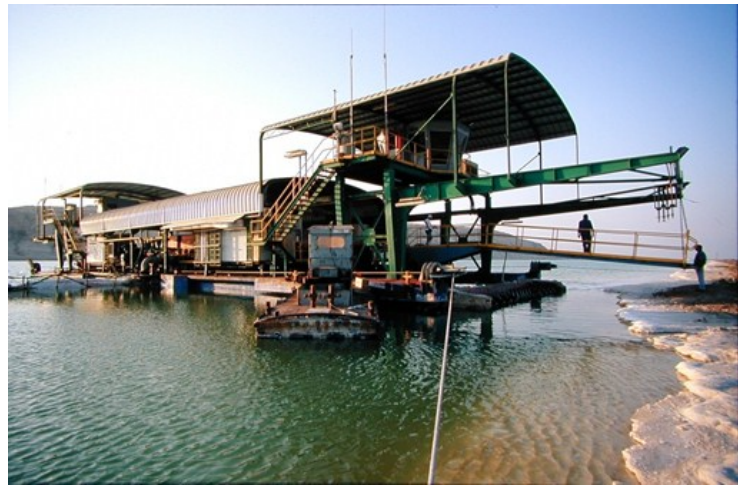
Dredger used to harvest the carnalite from the pond's bed.

BSI. 2008. Guide to PAS 2050. How to assess the carbon footprint of goods and services. BSI 389 Chiswick High Road, London W4 4AL.