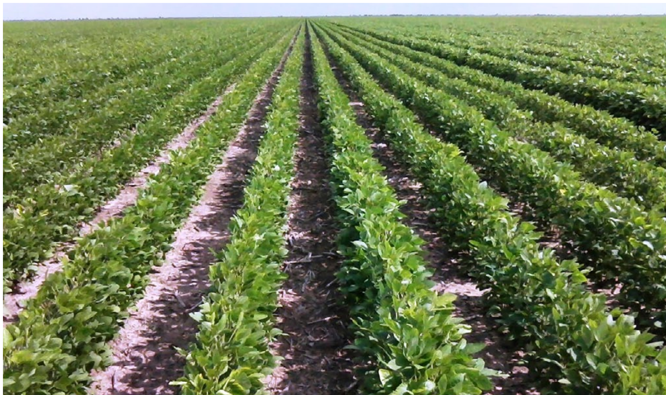
Soybean crop in Brazil - grown to new horizons. Alvorada farm, Brazil.