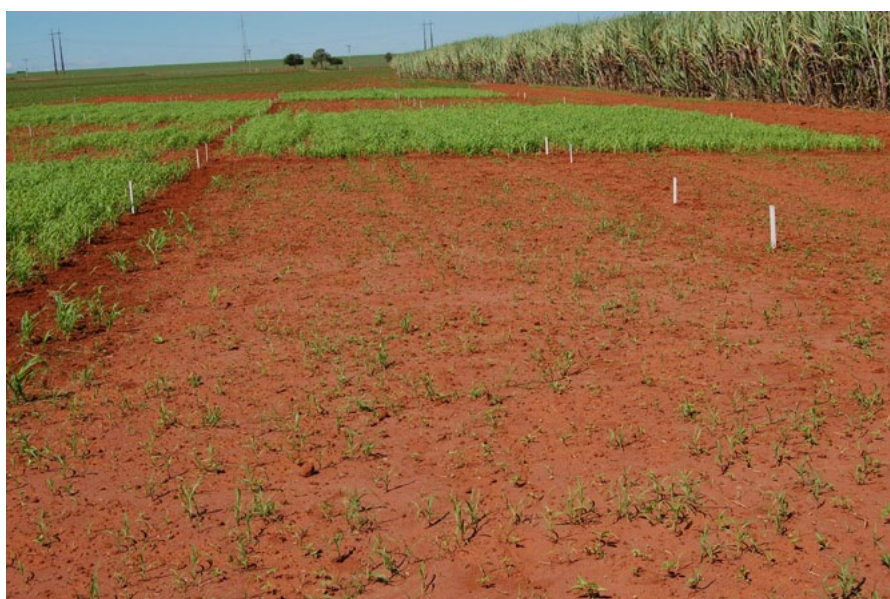
Experimental site in Rio Verde, Goiás, Brazil.