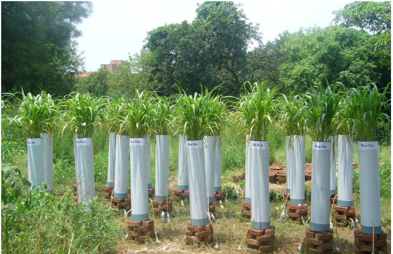
Experimental setup at Jamia Hamdard University.