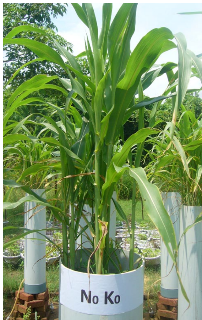
Sorghum plant grown in the experimental drum (column).

Sorghum is the fifth most important cereal crop grown in the world and is also valued for its fodder and stover. It is a known accumulator of toxic levels of nitrate even at moderate N fertility levels. In India, forage sorghum is grown on 2.6 million ha predominantly in the states of western Uttar Pradesh (UP), Haryana, Punjab, Rajasthan and Delhi, which fulfills over two thirds of the fodder demand during the Kharif (summer) season.