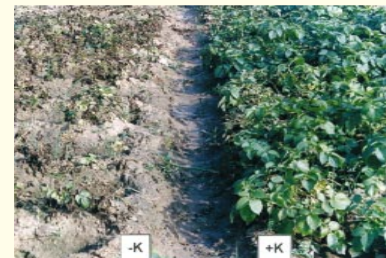
POTATO – No late blight disease with Potash application (Jalandhar, Punjab - 1998)