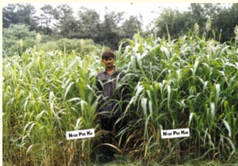
SORGHUM - Potash fertilization sustains high crop yields (Gurgaon, Haryana - 2001)

Successive harvests remove large quantities of potash from the soil and if potash is not sufficiently replaced by fertilization, soils become deficient in K.