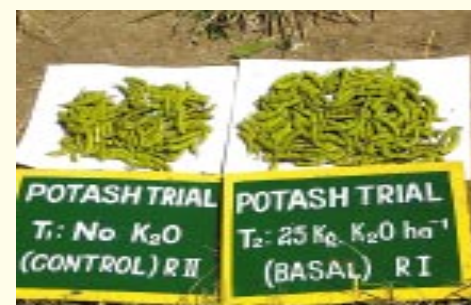
SOYBEAN – More yield and bigger grains with Potash (Sehore, M.P. - 2002)