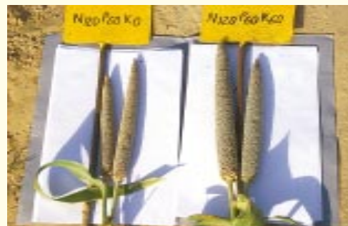
BAJRA – Higher yield and better quality with Potash (Bawal, Haryana - 2002)

Crops need many essential nutrients for optimum growth, yield and quality. Nitrogen (N), Phosphorus (P), Potassium (K), Sulphur and Zinc are some of the essential plant nutrients. Crops need N, P and K in large amounts, hence these are applied through fertilizers. Application of plant nutrients in optimum ratio and adequate amounts is called Balanced Fertilization.